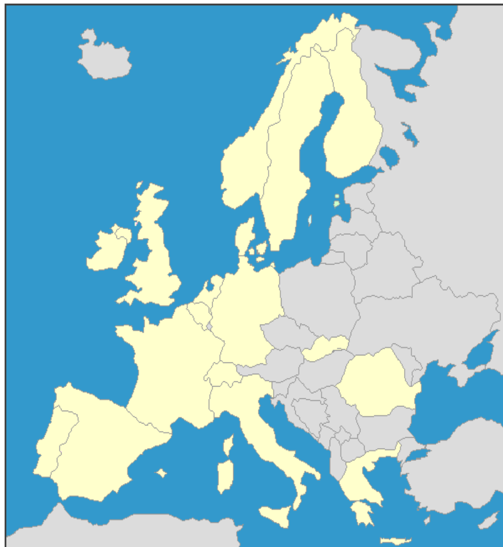
Figure: Representation in ENCePP